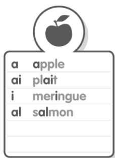
Extended Sound Box