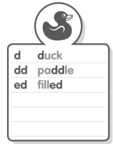
Extended Sound Box