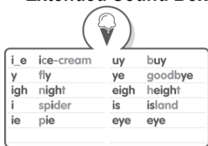
Extended Sound Box