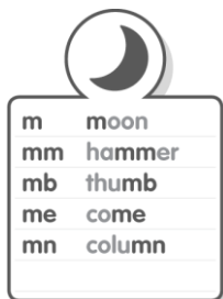
Extended Sound Box