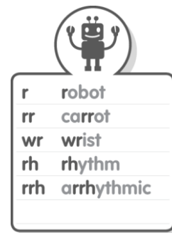
Extended Sound Box