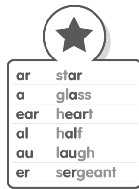
Extended Sound Box