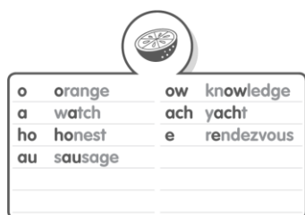
Extended Sound Box