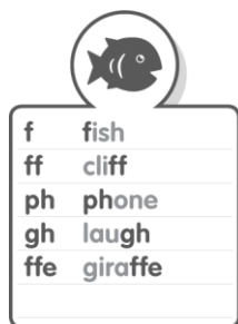
Extended Sound Box