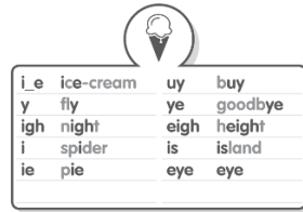
Extended Sound Box