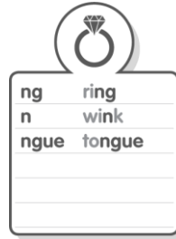
Extended Sound Box