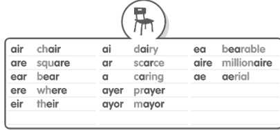
Extended Sound Box