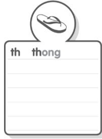
Extended Sound Box