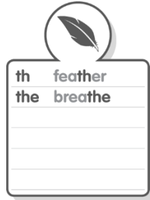
Extended Sound Box