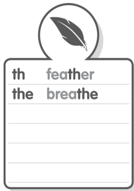
Extended Sound Box