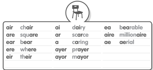
Extended Sound Box