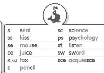
Extended Sound Box