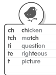
Extended Sound Box