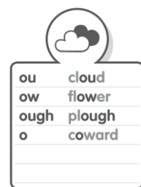
Extended Sound Box