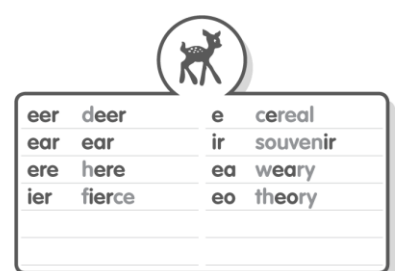
Extended Sound Box