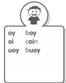
Extended Sound Box